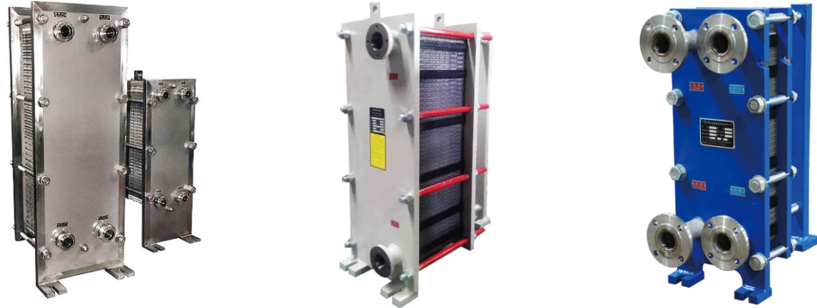
Plate Heat Exchanger